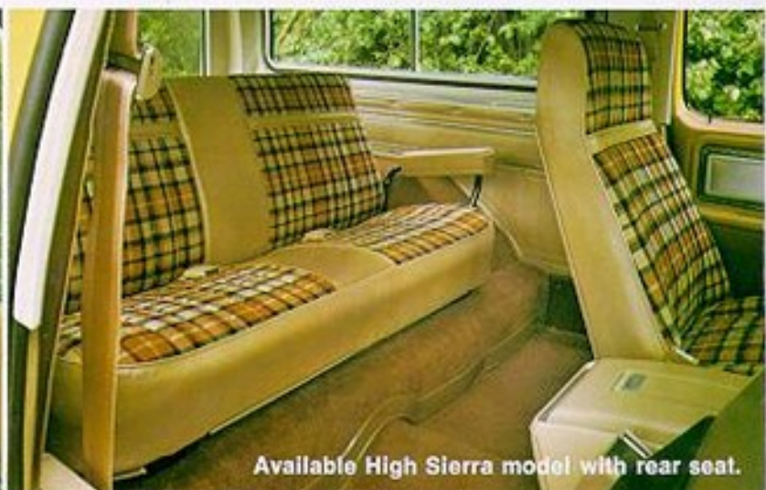
Available High Sierra model with rear seat.