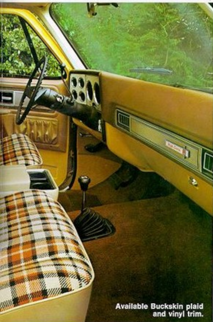
Available Buckskin plaid and vinyl trim.

driving conditions change. All 4-wheel drive controls are conveniently located inside the cab. With Jimmy's full-time system there's a combination of balanced traction and driving power delivered to both axles that lets you operate on paved and unpaved roads under varying conditions and off road as well — all without having to change back and forth between 2-wheel and 4-wheel drive.