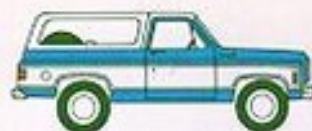
Two-Tone Paint with White Hardtop