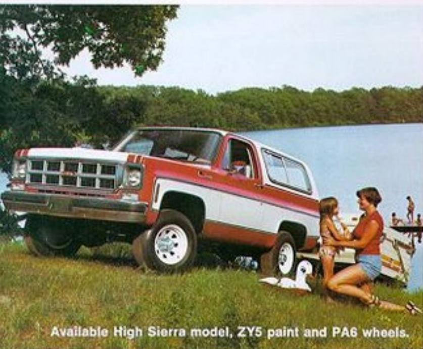
Available High Sierra model, ZY5 paint and PA6 wheels.

interior, shown below, includes new high back bucket-type seats in handsome Saddle custom cloth and vinyl trim. (All-vinyl open high-grain trim also is available.) Both custom cloth and vinyl and all-vinyl seats come in Blue, Buckskin and Red colors with Red being a new offering for the cloth and vinyl trim. Mandarin Orange is also available for the all-vinyl trim. The wall-to-wall floor covering is color keyed and extends to the rear, including wheelhousings, when the new available fold-up rear passenger seat is ordered.