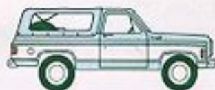
Two-Tone Paint with Available Soft Top

All 1978 Jimmy models include the following General Motors Safety Items as standard equipment. FOR OCCUPANT PROTECTION: Seat belts with push-button buckles at all passenger positions, combination seat and inertia-reel shoulder belts for driver and right front passenger (with reminder light and buzzer), energy absorbing steering column, passenger guard door locks, safety door latches and stamped