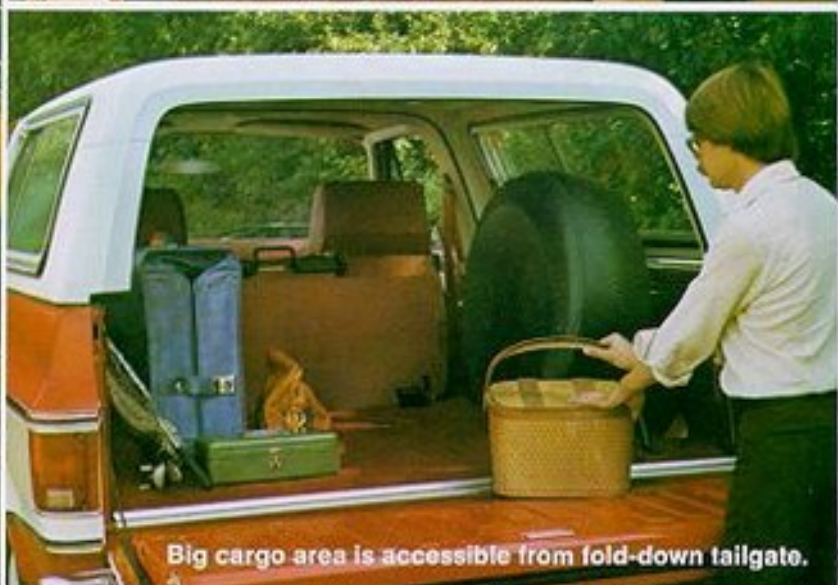
Big cargo area is accessible from fold-down tailgate.

After all sheet metal parts are cleaned and dried, they are primed by immersing the entire body, along with doors and tailgate, in a prime paint emulsion that is electrically charged opposite to the body which coats the metal evenly and completely as it is electromagnetically drawn into the corners and seams of the metal surfaces inside and out. Potentially vulnerable joints are sealed against gathering moisture through the use of sealing compounds. A long-lasting acrylic enamel is used for finish painting. For added protection in certain enclosed areas, an alumi-