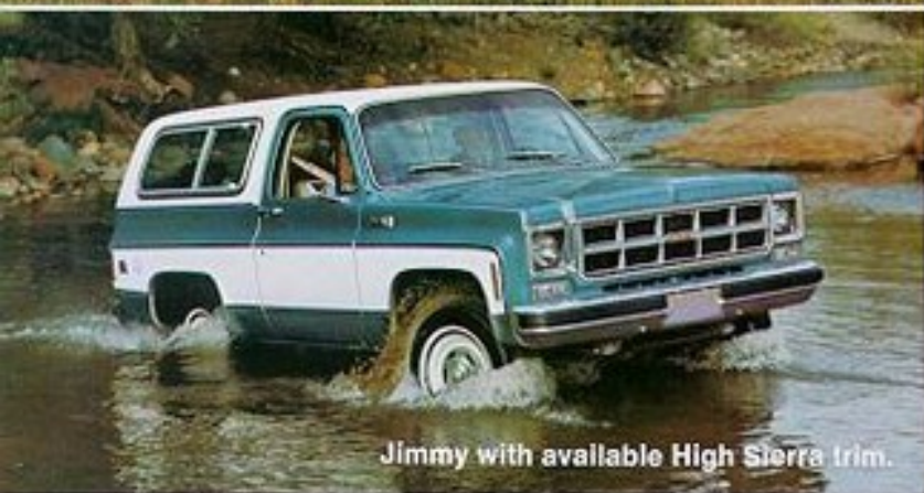
Jimmy with available High Sierra trim.