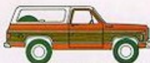
Available Wood-grain Trim