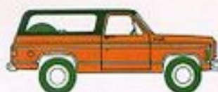
Solid Paint with Black Hardtop